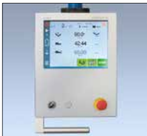
Control with coordinate display