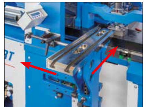
Movable front gauge with digital readout