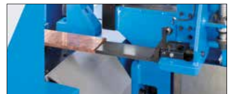
CNC controlled backgauge